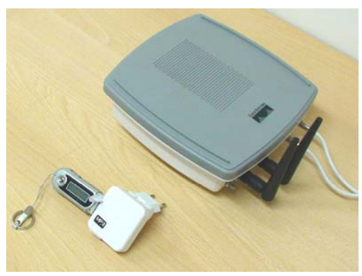
Fig.1. Wi-Fi router and FM transmitter

distance between transmitters and the user. Our experiments showed that SNR of an FM signal is almost a step function which is unsuitable for high-accuracy positioning. Therefore, we chose the RSSI as a parameter suitable for FM positioning also considering the fact that most of the current FM receivers provide it to enable autotuning.